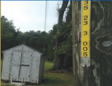
This shed is in violation of NOVEC's right-of-way policy because it blocks access to the overhead power line.

For NOVEC to keep the power on, or to restore power during outages, staff must be able to locate the problem quickly. When NOVEC builds the electric-distribution system infrastructure, all equipment is placed in easily accessible and visible locations. New electrical rights