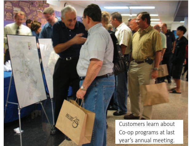
Customers learn about Co-op programs at last year's annual meeting.