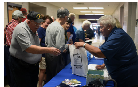
NOVEC employees welcome customers to annual meeting.